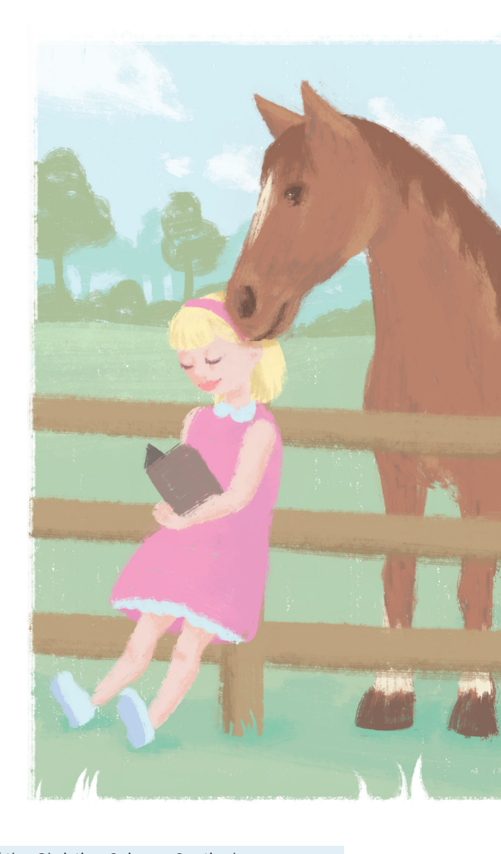
Originally published in the April 4, 2022, issue of the Christian Science Sentinel.

Christ Jesus promised, "Ye shall know the truth, and the truth shall make you free" (John 8:32). I was sure that the truth would heal Prince, and it did. Within a very short time, the cuts healed, and Prince and I were trotting—even galloping—freely across the fields again, glorifying our very good God.•